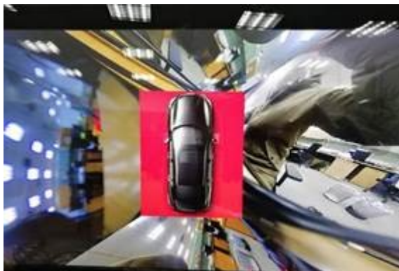
Figure 3. All cameras' views on the display