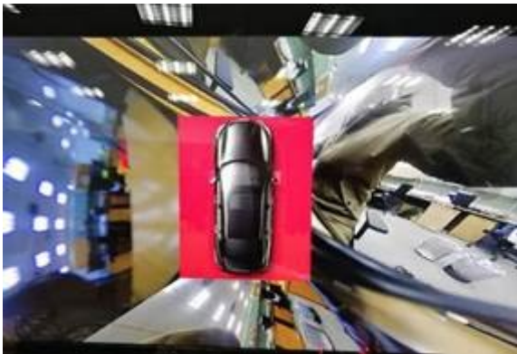
Figure 2. All cameras' views on the display